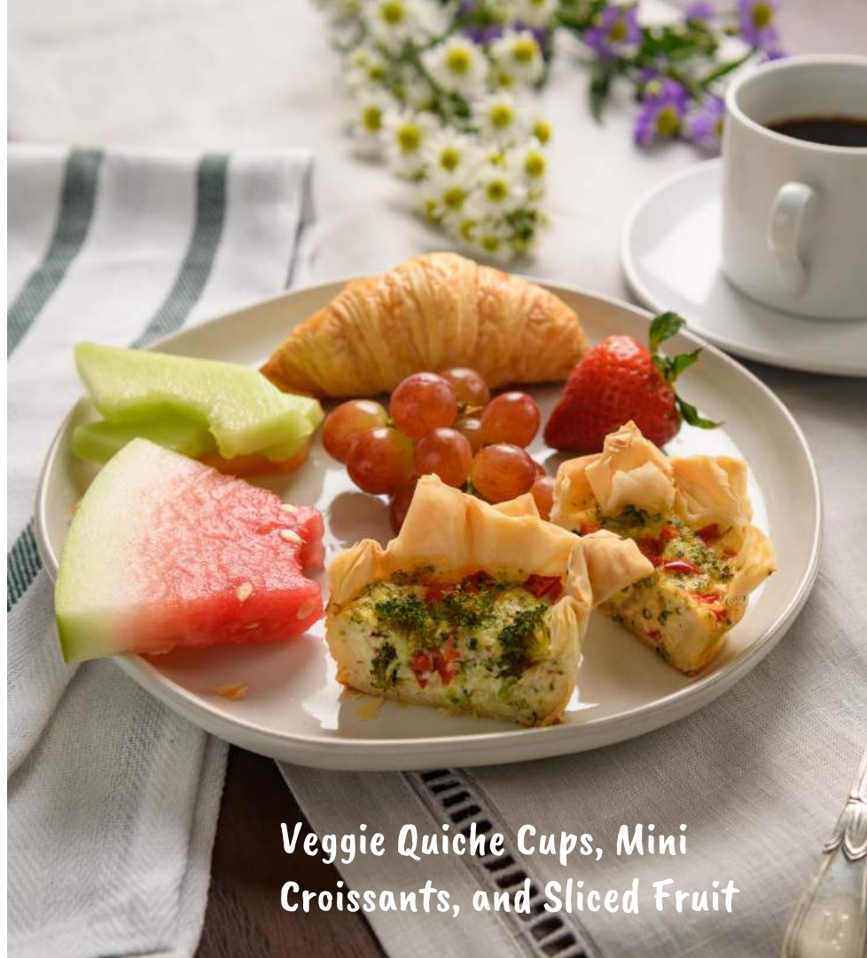
Veggie Quiche Cups, Mini Croissants, and Sliced Fruit

We have vegan and gluten-free muffin options available for those with allergies. These always come separately packed and labeled.