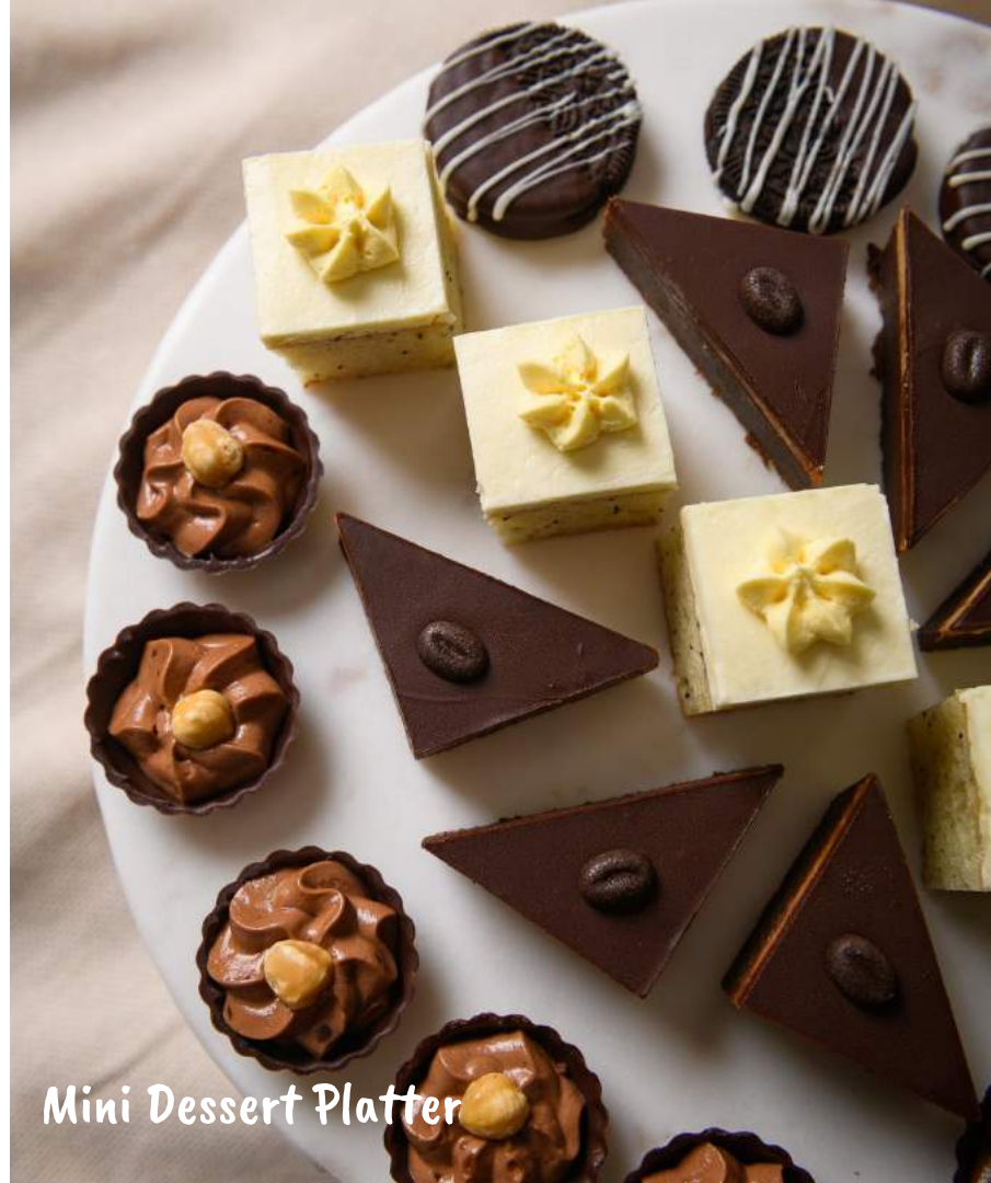
Mini Dessert Platter

Looking for an afternoon snack but no sweet tooth? Our healthy snack option might be for you. This includes an assortment of: granola, dried fruit and nut mix, crackers, cheese, and turkey jerky (pg. 7 of menu).