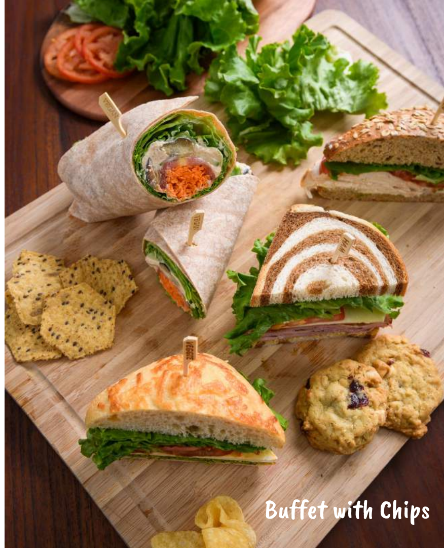
Buffet with Chips

We also offer boxed lunches, entree salads, soups, and various side salads that make an excellent choice for lunch!