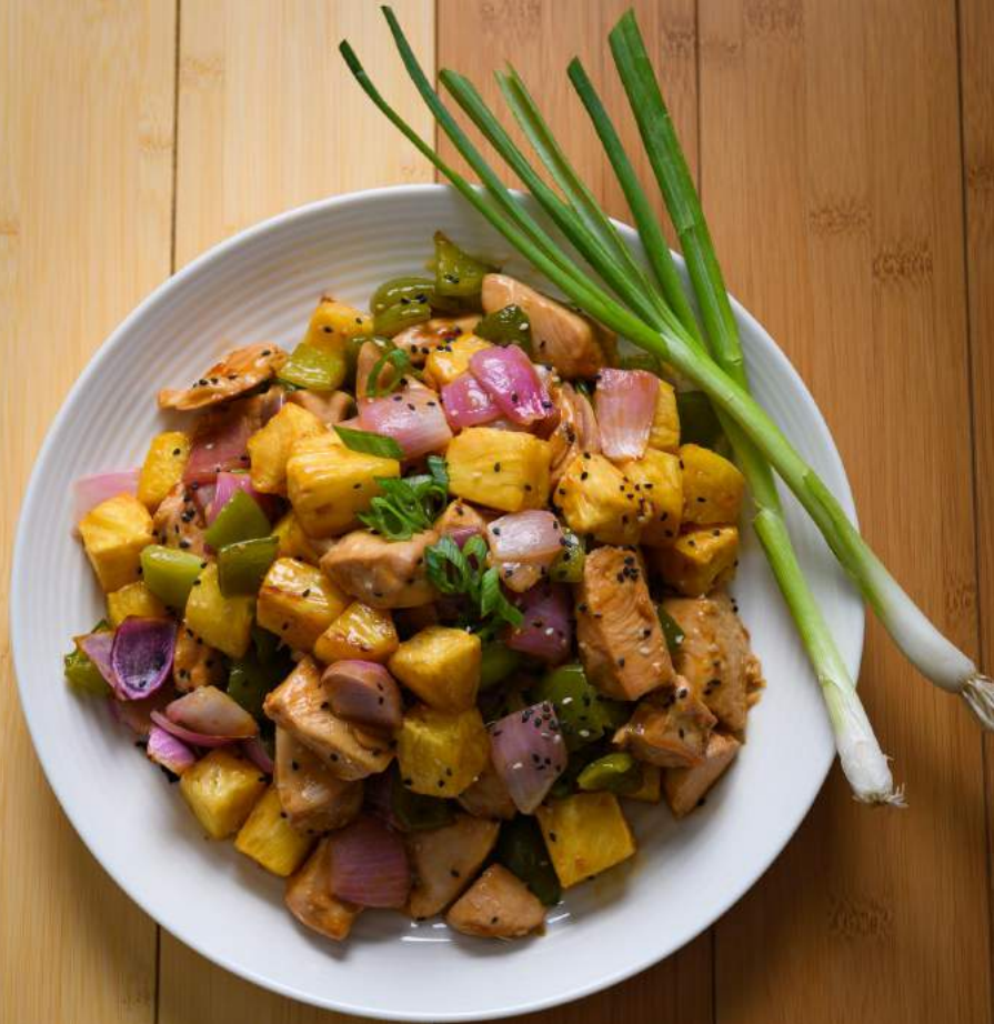
Teriyaki Chicken Bowl